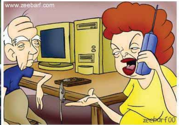
"Okay your father managed to get a mouse. Now how do we use it?"