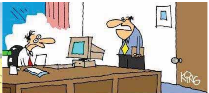
"You should check your e-mails more often. I fired you over three weeks ago."