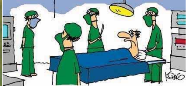
"Nurse, get on the internet, go to SURGERY.COM, scroll down and click on the 'Are you totally lost?' icon."